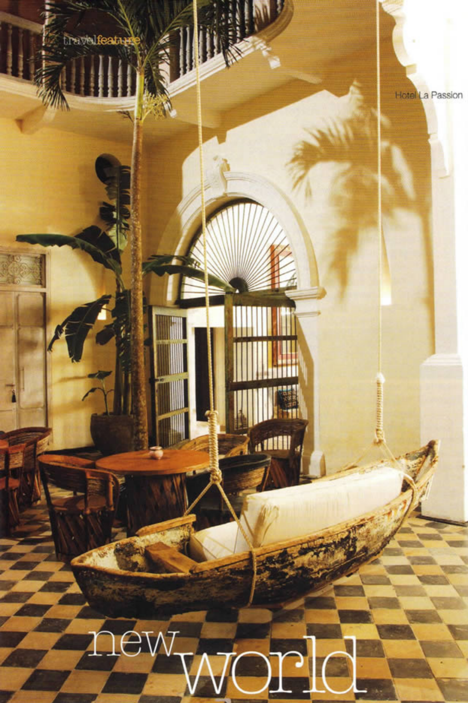
Hotel La Passion