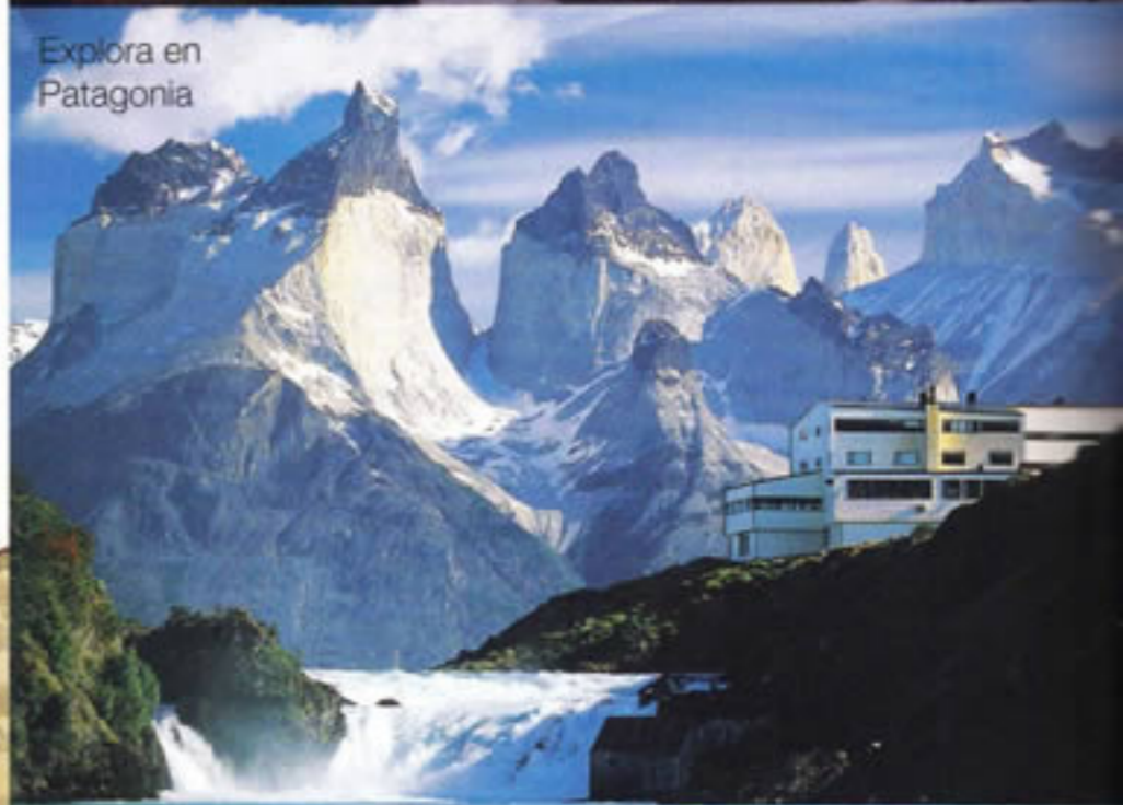
Explora en Patagonia