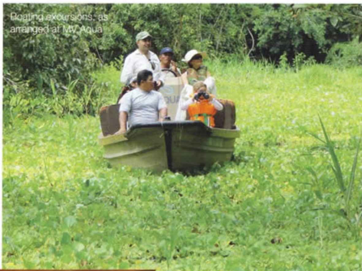
Boating excursions, as arranged at MV Aqua