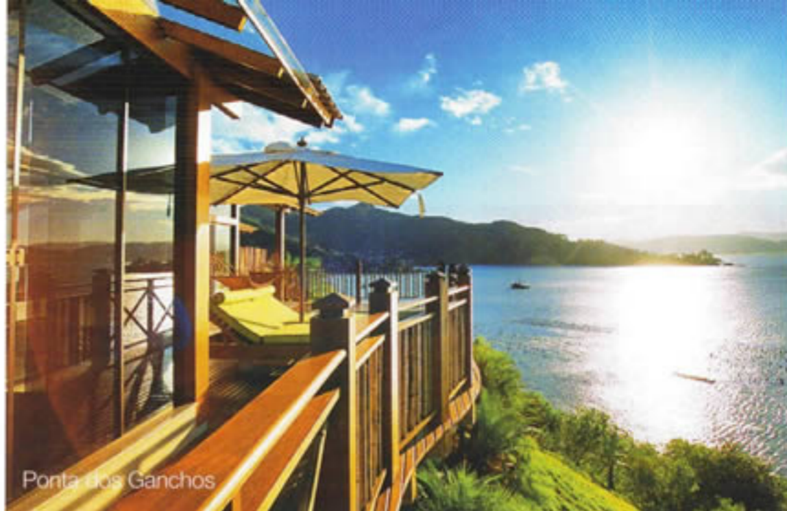
Ponta dos Ganchos

Without question one of Brazil's most luxurious boutique hotels, and the perfect choice for people who like their beach holidays to involve plenty of pampering. Located on a private peninsula, the twenty five cabins of Ponta dos Ganchos are set in picture-