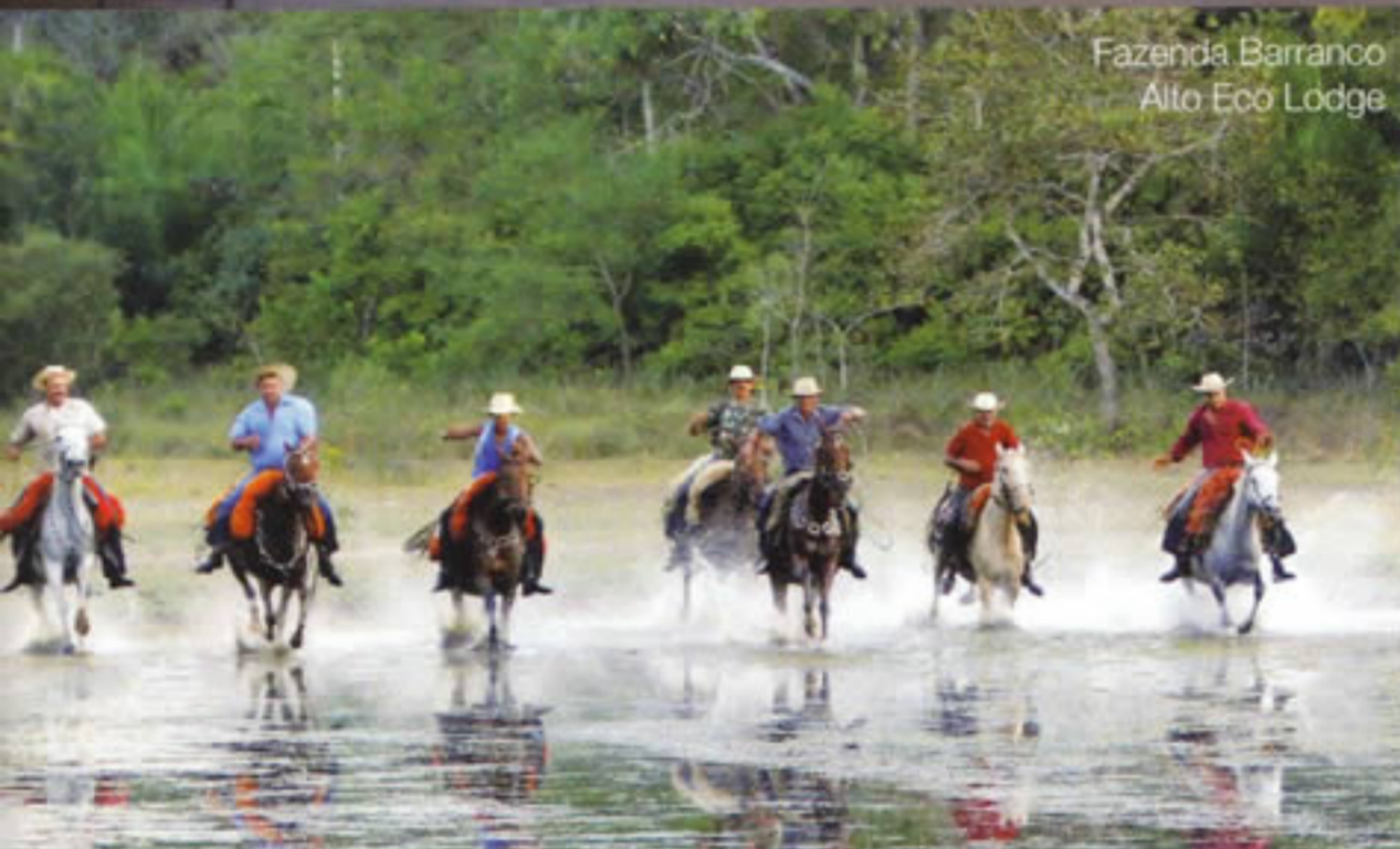
Fazenda Barranco Alto Eco Lodge

Torres del Paine National Park, Chile. Tel: +56 2206 6060; explora.com